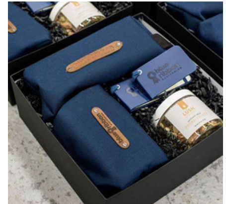
Branded Products Varies