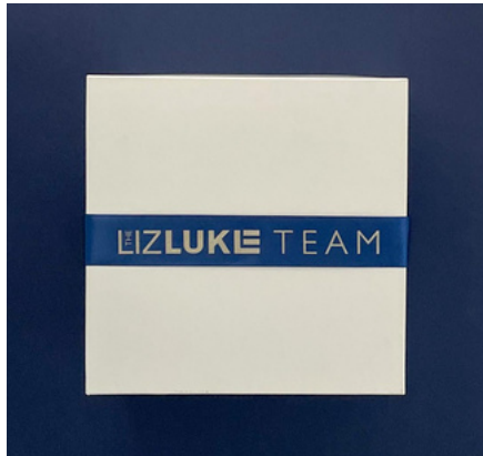
Branded Ribbon Starting at $5/gift