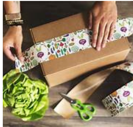
Branded Packing Tape Starting at $3/gift