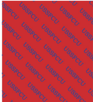
Branded Tissue Paper Starting at $7/gift